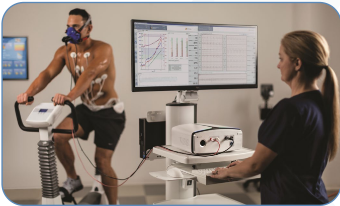
Figure 2. Vyntus™ CPX is an example of a CPET measuring device*.